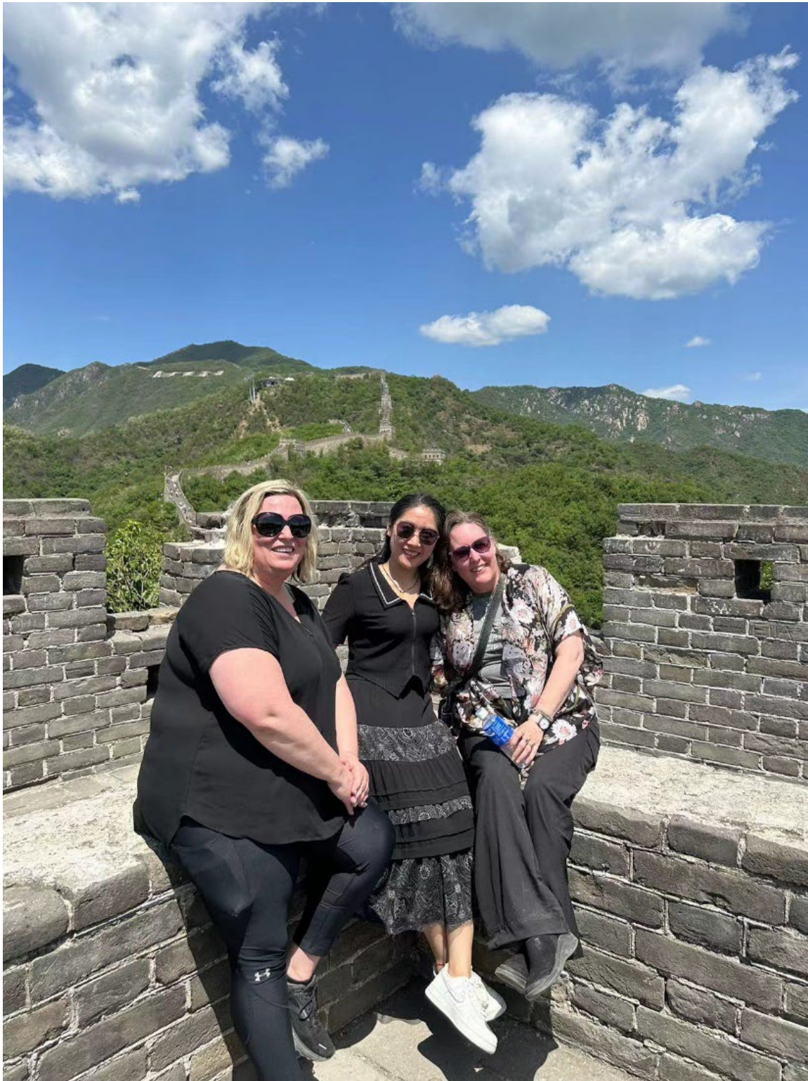
Photo on the great wall with a Chinese lady, because she wanted to!