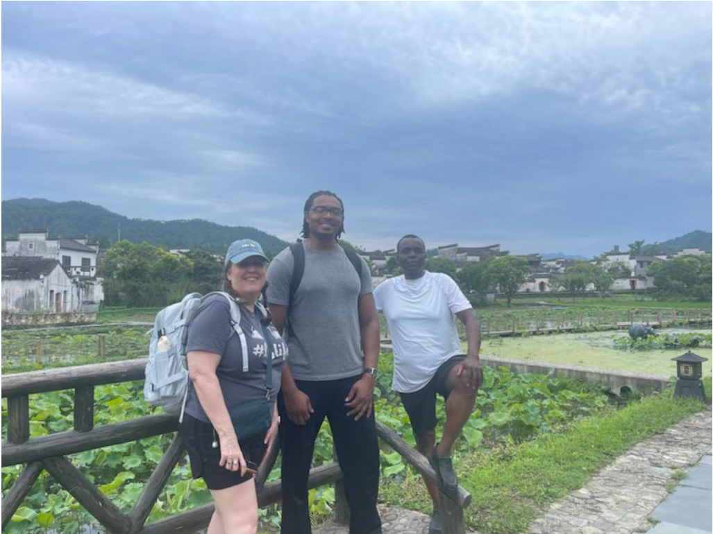
Another photo with random Chinese people