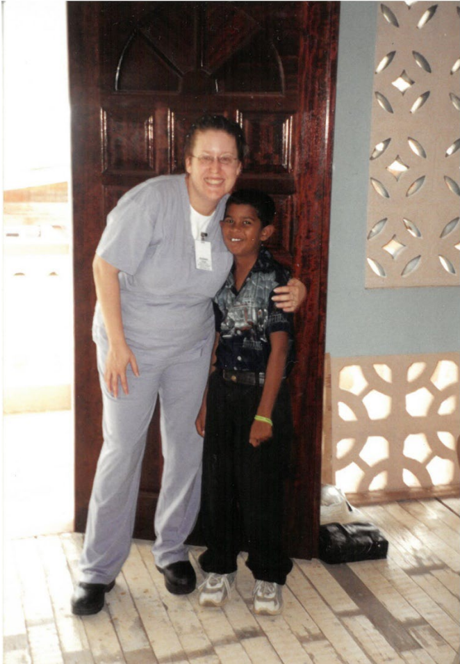
2004 Enmore, Gyanna, Medical mission trip