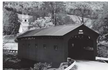
Arlington Green Covered Bridge, Vermont

Bridge between didactic training and professional employment